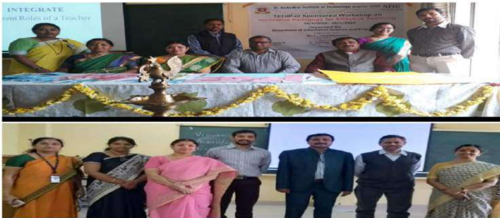
Professor & Nodal Officer( Academic)